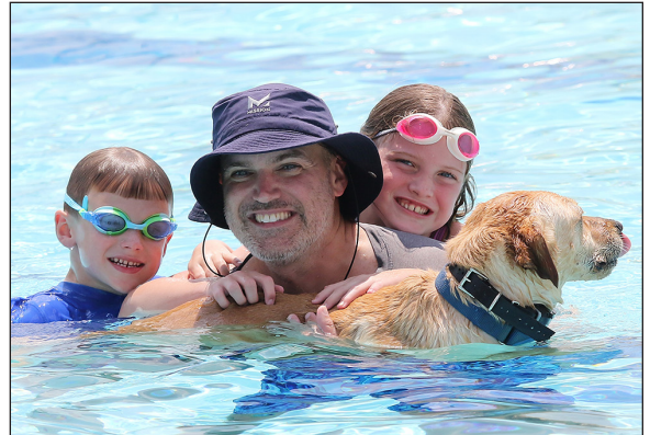
Wet N' Wag caps summer swim season

There is no bond like that between a dog and his owner, as this always family-favorite event proved again!