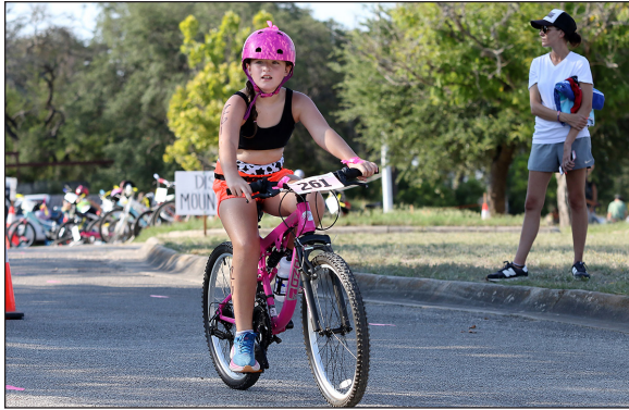
Kids Triathlon at Singing Wind Park