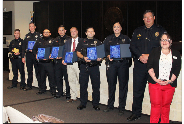
KPD officers honored