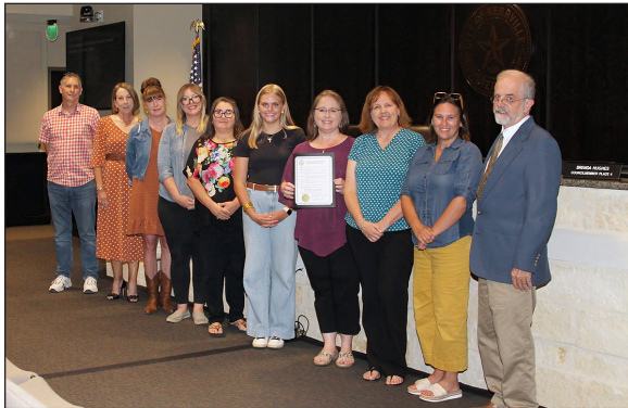
Mayor issues tourism proclamation

Kerrville Mayor Joe Herring, Jr. issued a proclamation at the Aug. 13 city council meeting proclaiming Kerrville a "tourism friendly community" and recognizing the contributions of the Kerrville Convention and Visitors Bureau (KCVB). The proclamation recognized travel and tourism's significant cultural benefits for the city and lauded the city's many tourism offerings, including multiple sporting events, hiking and biking trails, Guadalupe River activities, parks, arts, culture, and music concerts.