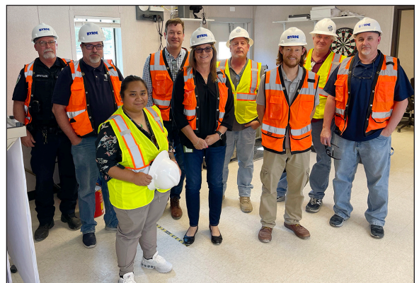
Touring the Public Safety Facility site