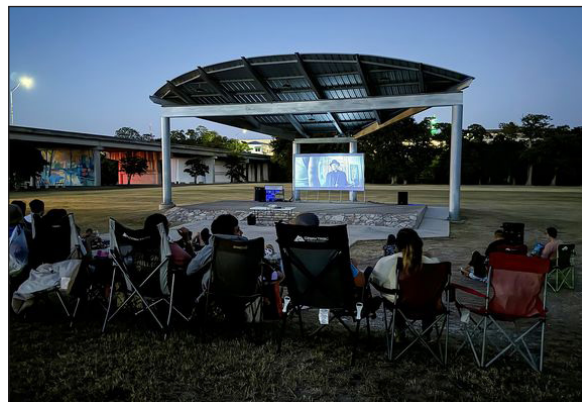
Parks & Rec hosts Art in the Park and Movies in the Park