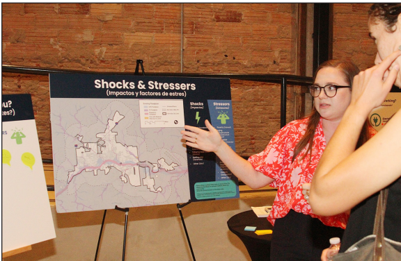
Comprehensive Plan update

The City of Kerrville and Freese and Nichols welcomed citizens to the Arcadia Theater Oct. 24 for an initial discussion on updates to the Kerrville 2050 Comprehensive Plan, which was adopted by the city council in 2018 after a long input process with Kerrville citizens.