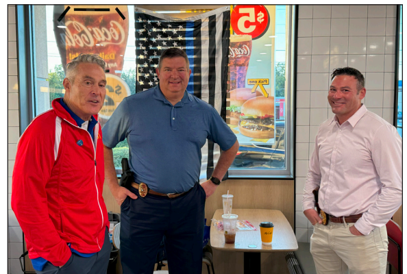
Coffee with a Cop at McDonald's