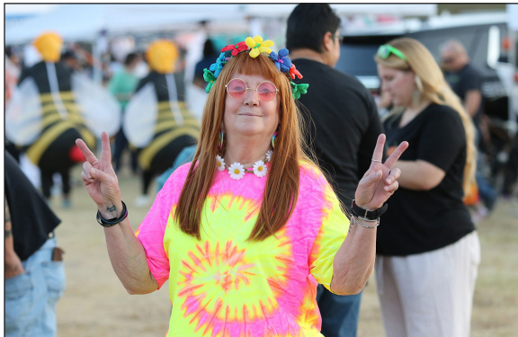
Family Fright Night caps busy October