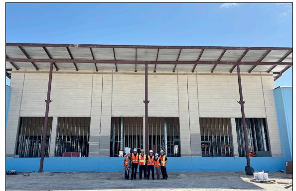
KFD administration tours Public Safety Facility