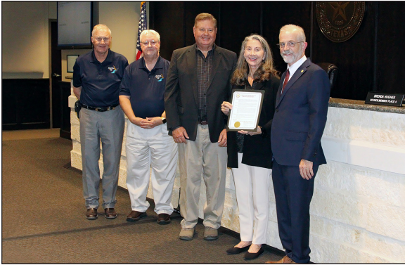
Dark Sky month proclamation