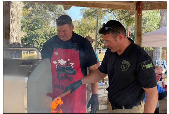
KPD hosts community cookout