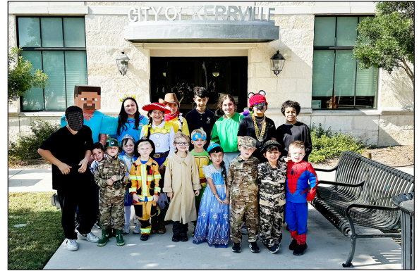
Notre Dame students visit city hall

This marks the 15th year that Notre Dame students have collected canned goods. The City of Kerrville thanks these students and their parents and teachers for their willingness to serve others!