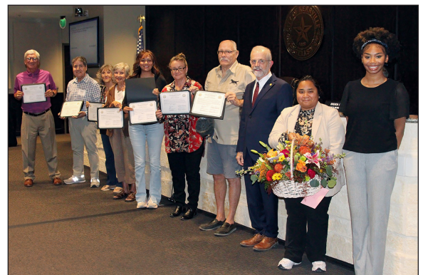
Citizens Academy recognized

The mayor and council also issued a Certificate of Recognition to participants in the second City of Kerrville Citizens Academy class, which was started to offer citizens a close-up view of the city’s departments and budgeting process.