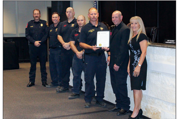
Fire Prevention Week