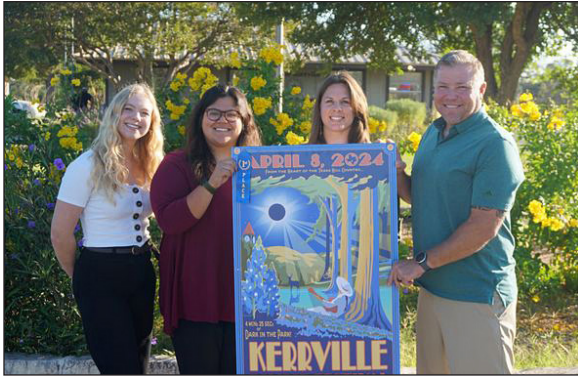
Kerrville Eclipse Festival wins awards