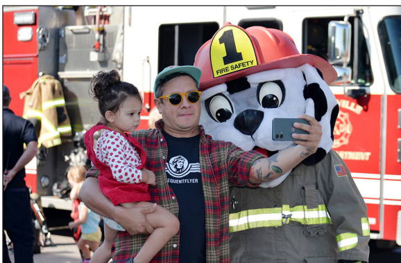
Fire Pup visits the library

As usual, Fire Pup proved a hit with the kids!