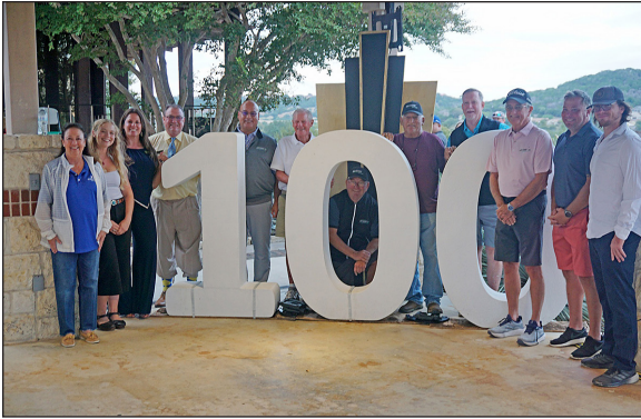
Schreiner Golf Course celebrates 100 years