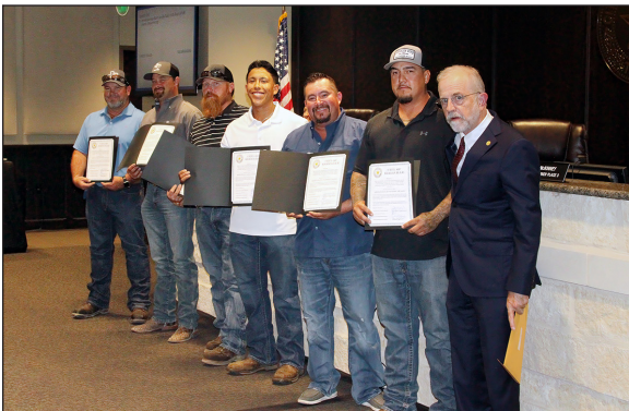
KPUB linemen get Kerrville Kindness Award