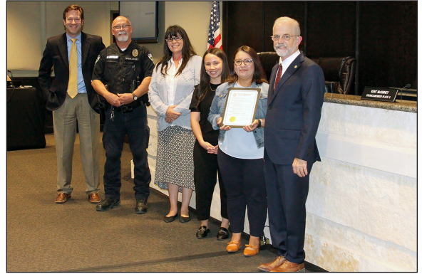
Municipal Court week

Mayor Herring also designated Nov. 4-8, 2024 as Municipal Court week in recognition of the role municipal courts play in preserving public safety