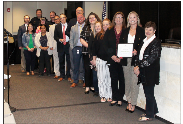
City earns Best-In-Class Employer award

Gallagher (NYSE:AJG), a global insurance brokerage, risk management and consulting services firm, is headquartered in Rolling Meadows, Ill. Gallagher provides these services in approximately 130 countries around the world through its owned operations and a network of correspondent brokers and consultants