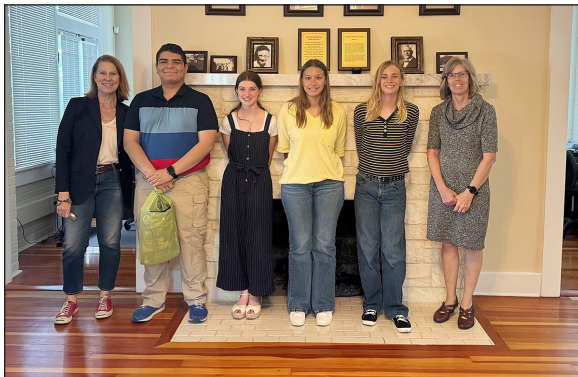
KAYLA visits the library