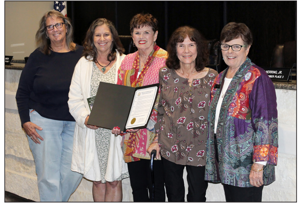
Mount Wesley neighborhood recognized