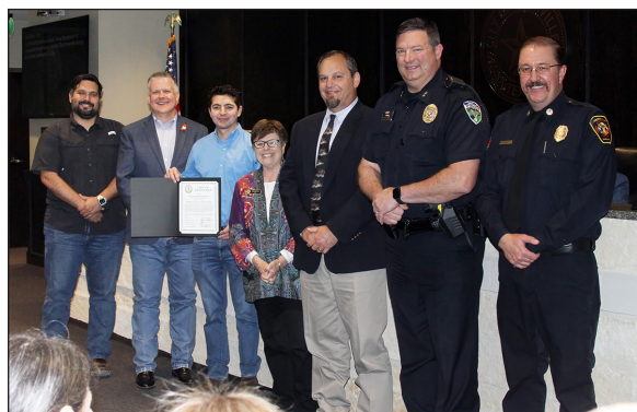
TXDOT receives Kindness Award