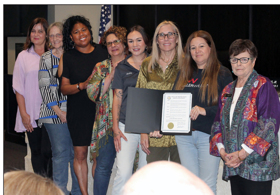
April is Fair Housing Month