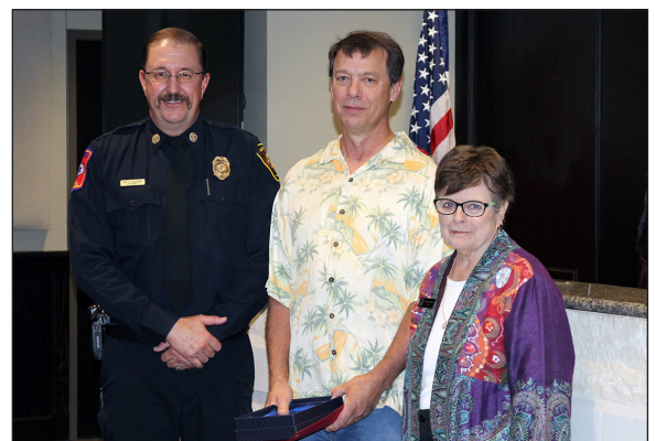
Former KFD member recognized