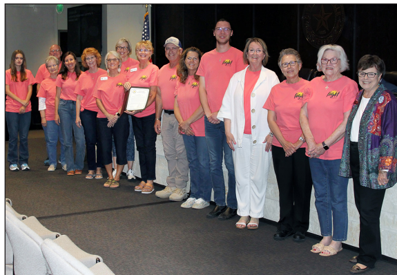
Light on the Hill earns Kindness Award

Light on the Hill also provided free lodging for first responders who came from out of town to assist in emergency planning for the eclipse.