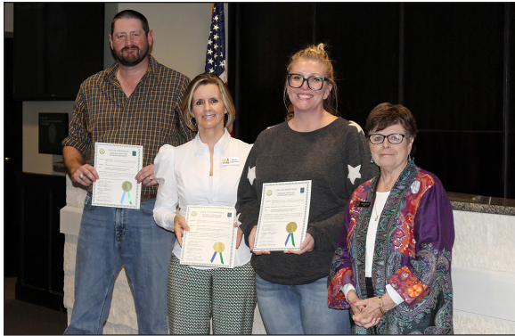
Animal Regulation Review Committee