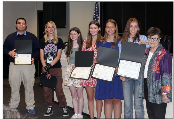
KAYLA members recognized

nized the 2023-24 Kerrville Youth Leadership Academy class for its completion of a year-long study of the City of Kerrville’s inner workings. KAYLA’s goal is to develop youth leaders committed to learning about local government and provide an overview of the complexity and variety of opportunities available through public service.