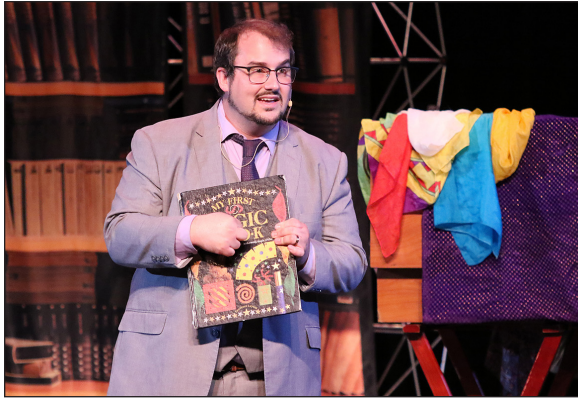
Magic show at the Cailloux