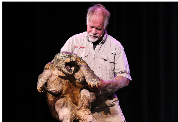
Reptile show at the Cailloux