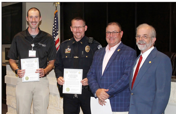
Certificate of Recognition