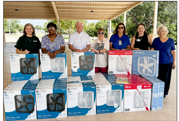
SSAC fan giveaway

The City of Kerrville's Senior Services Advisory Committee (SSAC) distributed 48 free fans at the large Louise Hays Park