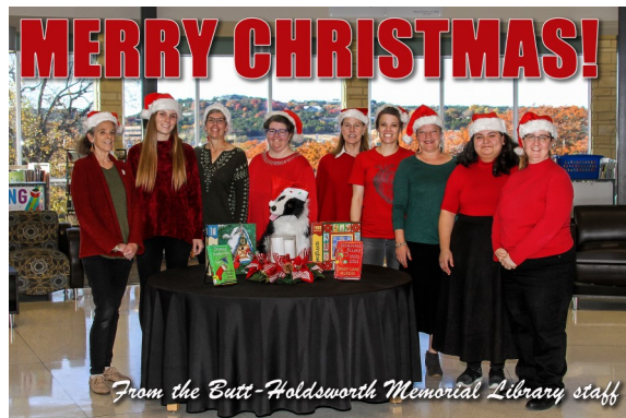
From the Butt-Holdsworth Memorial Library staff